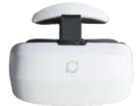
M2(High-end Mobile VR)