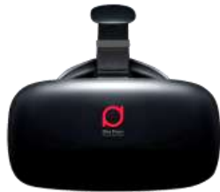
E2 -PC VR